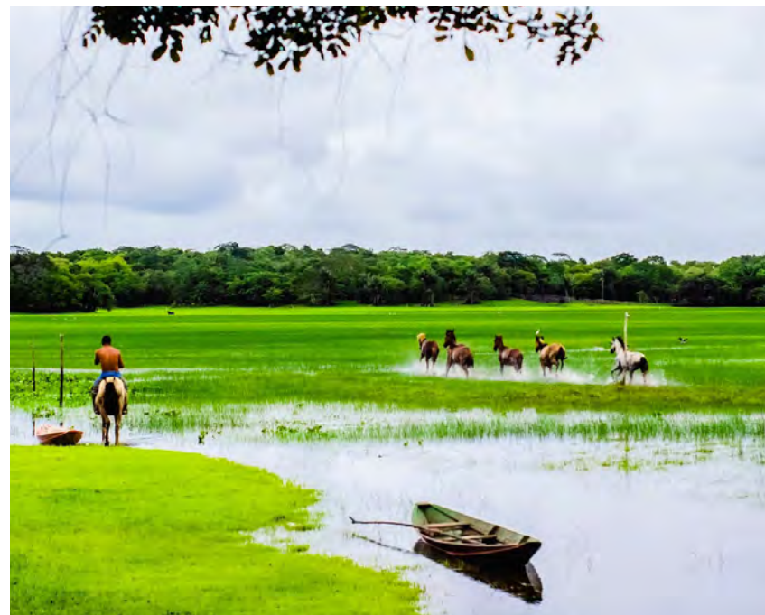
The Curiau Afro Brazilian Social Carbon Project is funded with support from ReSeed.

organic farming methods are regenerative and can help to heal environmental depletion and slow climate change.