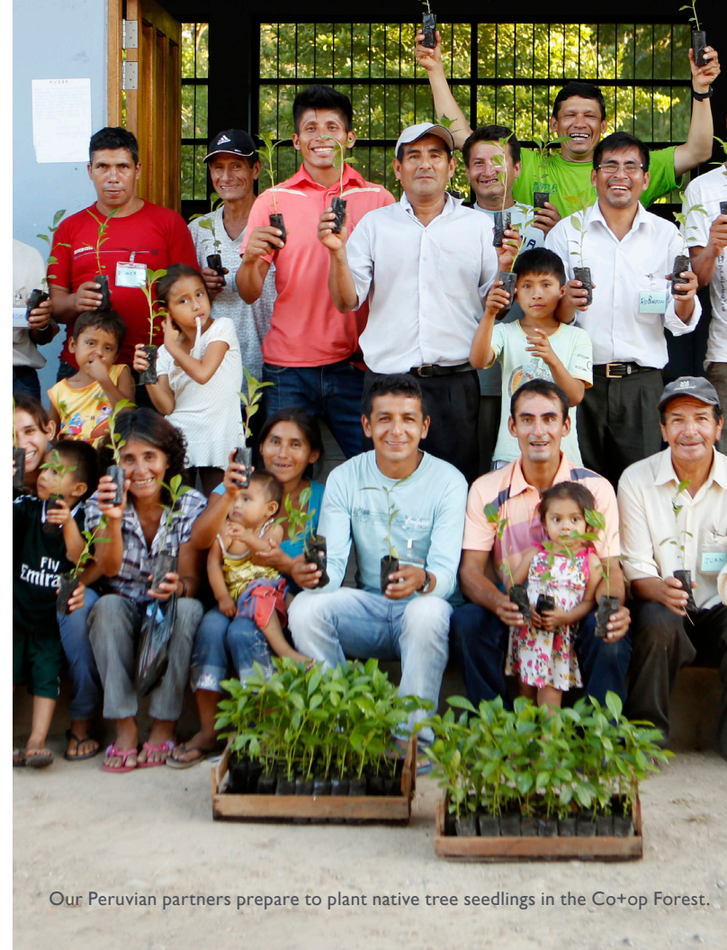
Our Peruvian partners prepare to plant native tree seedlings in the Co+op Forest.

Trees naturally absorb carbon dioxide—a greenhouse gas—from the atmosphere, effectively slowing the rate of climate change. As of 2019, Co+op Forest is home to an estimated 1.8 million trees and the region has been named a UNESCO Biosphere Reserve, to serve as a model of sustainable communities.